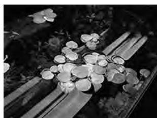
Frogbit floating on water